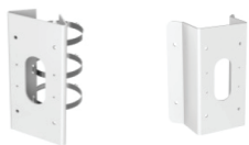
DS-1475ZJ-SUS Vertical Pole Mount